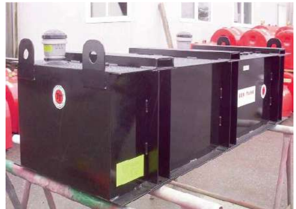
Compatible with a wide range of fuels and chemicals, including conventional diesel and biodiesel