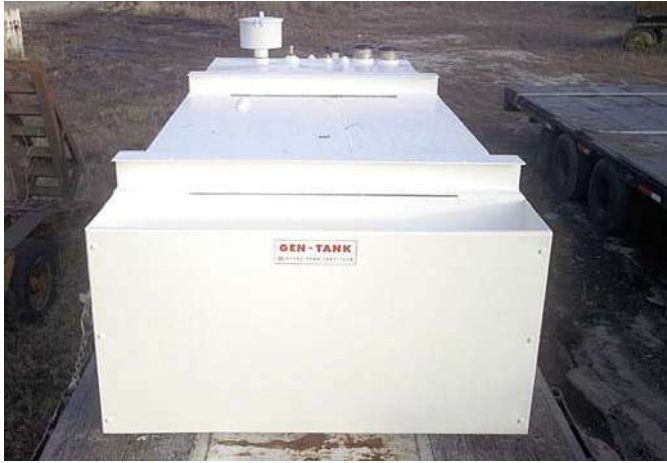
Low profile design enables structural support for the generator mounting

GEN-TANK Generator Base Tank provides sturdy support for your backup or emergency power generator. The low profile of the GEN-TANK design serves as the structural support for the generator mounting, while providing storage for a complete supply of generator diesel fuel.